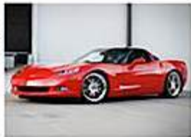
C6 Chevrolet Corvette