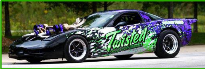
Shawn Lavrick's C5 Quad Turbo Coupe