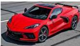
C8 Chevrolet Corvette

We specialize in Corvettes. Our tuner specializes in fuel injection and forced induction.