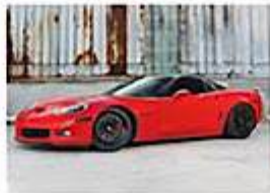
C6 Z06 Chevrolet Corvette