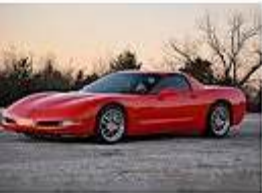
C5 Chevrolet Corvette