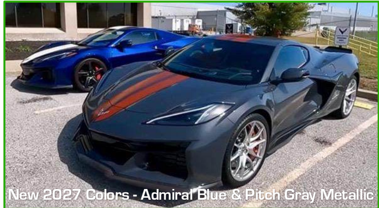
New 2027 Colors - Admiral Blue & Pitch Gray Metallic

The Stingray went up only $1,000 with its new LS6 engine, which has 45 more horsepower and increased torque. The Grand Sport model was officially revealed. It is the E-Ray's replacement, but with nice enhancements and options. If you are interested in purchasing a 2027, you should also look carefully, as option prices went up quite a bit. For example, the "D30" color override option went up from $695 to $1,495; "R8C" Museum Delivery went up $200 to $1,695 (after the $500 raise two years ago). And don't forget - you still have to pay a Destination Fee, even though you're doing an R8C Museum Delivery. Other option price increases include the interior carbon fiber packages "FA5 & FA6" each went up $250.