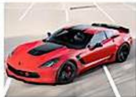
C7 Chevrolet Corvette