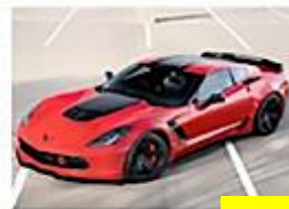
C7 Chevrolet Corvette