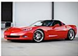
C6 Chevrolet Corvette