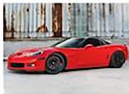
C6 Z06 Chevrolet Corvette