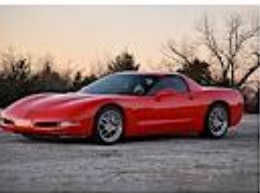
C5 Chevrolet Corvette