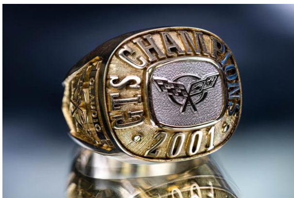
NCM Artifact #4: 2001 Gran Turismo Sport Championship Ring Commemorating Pratt & Miller Corvette Racing's 1 st Victory at the 24 Hours of Le Mans

28th Anniversary Celebration , the Museum's next major event, will be September 1 st – 3 rd . Many seminars and tours as well as track experiences are available. Online registration is open through August 15 th .