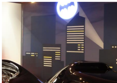
THE BAT SIGNAL LIGHTS UP GOTHAM CITY'S NIGHT SKY