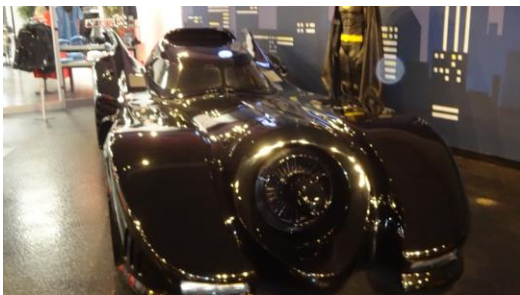
BATMOBILE FROM "BATMAN RETURNS"

Warner Brothers tasked Carl to build 3 long, low, sleek and highly sculptured Batmobiles for the movie. Loaded with dozens of crime-fighting devices, this CORVETTE powered Batmobile proves to be one of the world's most popular of all Batmobiles.