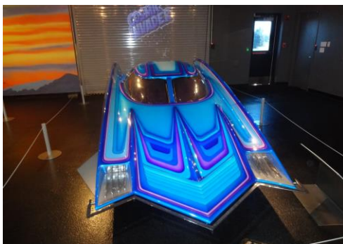
CARL CASPER'S "COSMIC INVADER" CONCEPT CAR