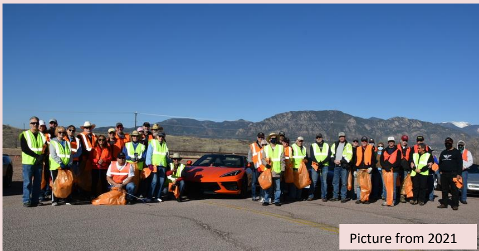
Picture from 2021