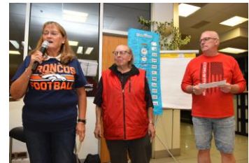
Charity Check Presentation