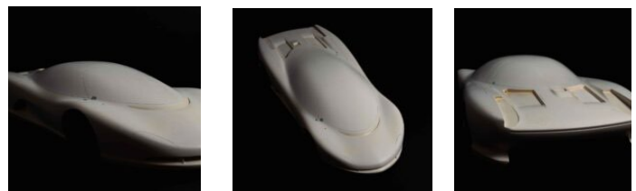
November 2022 Artifact of the Month: Corvette Indy Scale Model Mold