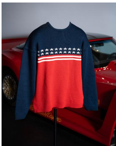
Patriotic Sweater given to John Greenwood by his Wife

The MSP will remain open during construction, expected to be completed by early 2024. The Holley Tower expansion includes a rooftop bar, expanded observation deck, additional classroom space, event rental space, fully-operational catering kitchen, redesigned guest check-in and retail area, and state-of-the-art amenities. The Kimberlee A. Fast Pavilion will offer quick-service dining with diverse menus, fully operational kitchen, expanded viewing for spectators, and track-side patio with seating.